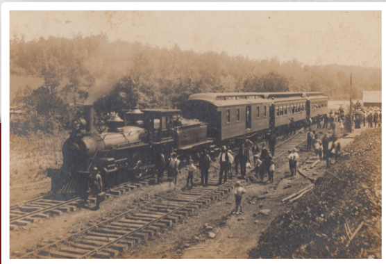
The steam engine "Greenville"

When sending requests, please provide complete contact information, including phone number and email address.